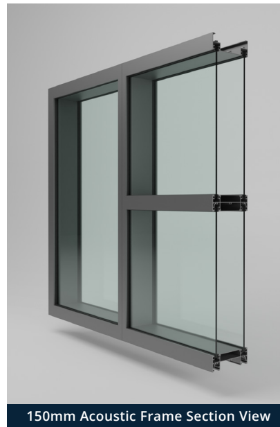
150mm Acoustic Frame Section View