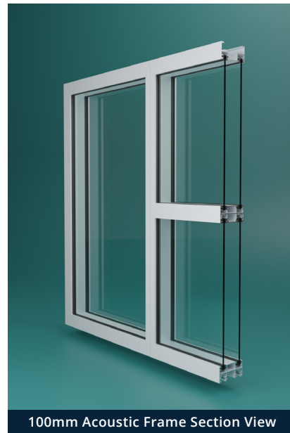
100mm Acoustic Frame Section View